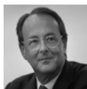
Erskine B. Bowles Charlotte, North Carolina